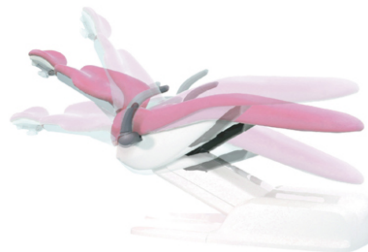
Ergonomics Chair Human engineering design, make chair and body match well, avoid patient's pushing feeling.