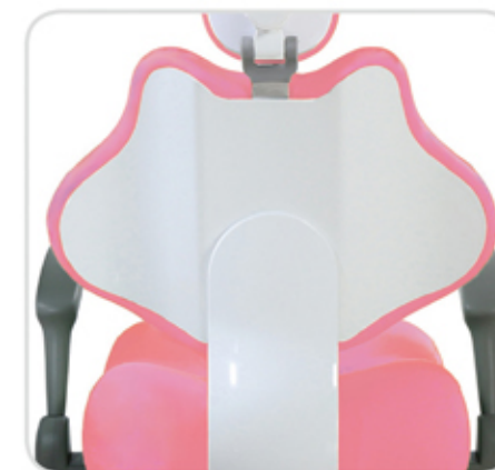
Aluminum casting backrest Special design for the backrest, is fit for patients perfectly.