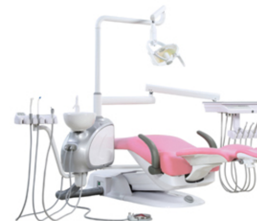
Chair lowest position 350mm Makes easy entry and exit for patient.