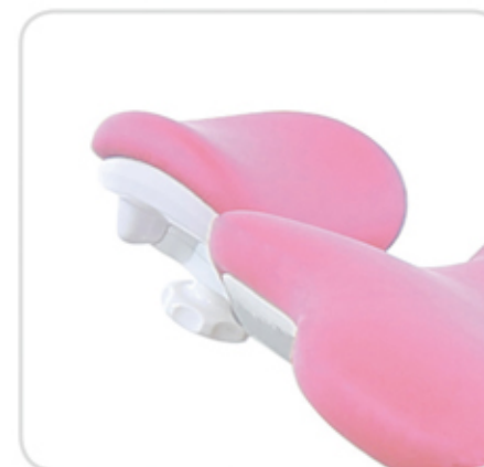
Comfortable headrest Articulating dual axis headrest with adjustable height.